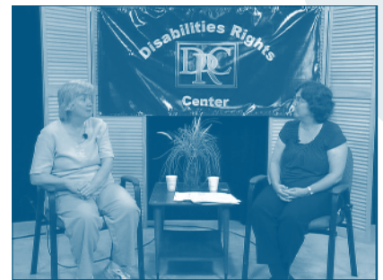
Disabilities Rights Center