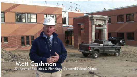
Elementary School Tours