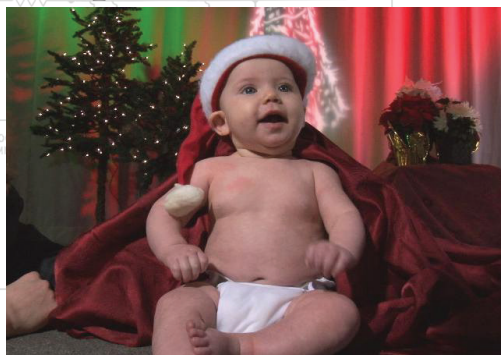
Our littlest holiday greeter