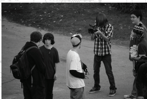
Video Scavenger Hunt