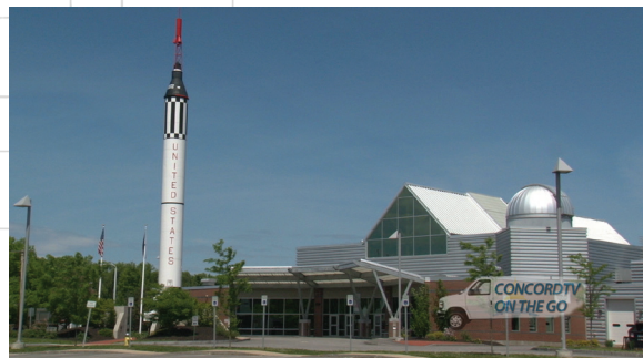
The McAuliffe-Shepard Discovery Center

Subjects in FY 11-12 included Black Ice Pond Hockey, Red River Theatres, and the award-winning episode about the McAuliffe-Shepard Discovery Center.