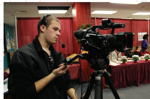
A student mans the camera at the auction