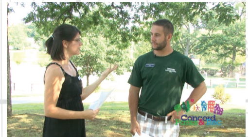
We are Serious About Fun!