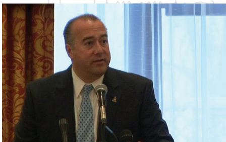
Mayor Jim Bouley