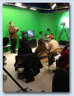
Training in Studio A.