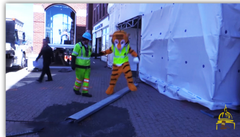
Main Street Minute