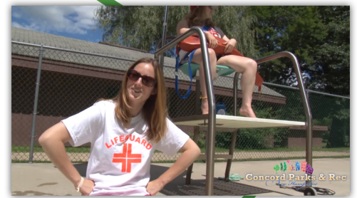
We Are Serious About Fun