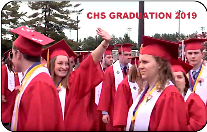
CHS GRADUATION 2019