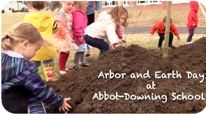
Arbor and Earth Day at Abbot-Downing School

Abbot-Downing School students participated in an Arbor Day celebration in collaboration with Concord Parks and Recreation.