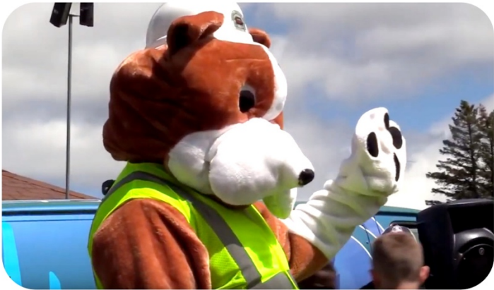
A quick look at some of the fun that was had at Concord General Services' Public Works Celebration held during National Public Works Week in May.