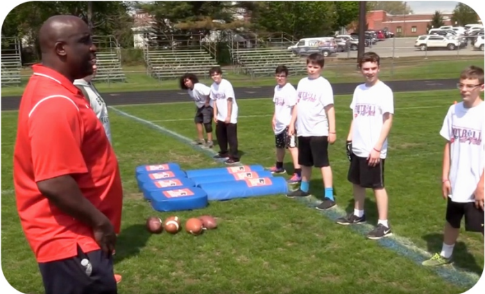
Concord Parks and Recreation hosted the Patriots Alumni Association for a free football clinic. Our video highlighted this great city program and hopefully builds interest for next year's clinic.